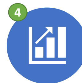
Getting to scale