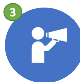
Communication & Disclosure