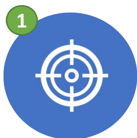
Metrics & Targets

Enable companies in the agriculture and food sector to collectively identify and develop targets aiming for Net Zero GHG emissions, and action and scale priority solutions to deliver these commitments in the run-up to the 2020 UNFCCC COP26.